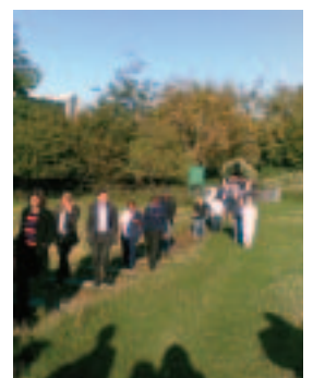
People at the Mudchute Farm assembly area

The Building Management Team would like to thank you for your participation, which was much appreciated. Valuable lessons were learnt that will be used to help improve our security procedures in future.